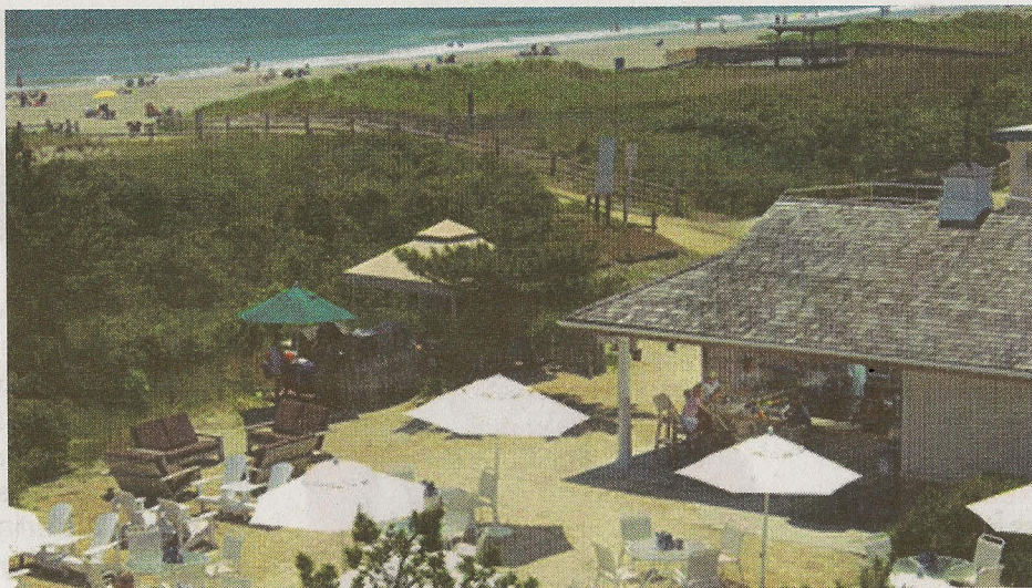
The Beach Club Bar and Grille at the Golden Inn, in Avalon, is casual for lunch and light-fare dinners with seating inside or outside on the sun deck. Daily drink specials and live entertainment are offered all summer.

The Octopus Garden is on the restaurant patio with outdoor dining and happy hours. You can't beat buy-one, get-one-half-price sushi from 4 to 7 p.m. every day. Thursdays are "Jimmy